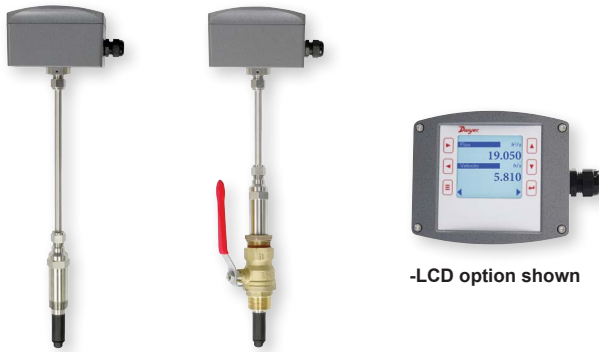
Shown with A-IEF-VLV-BR accessory valve